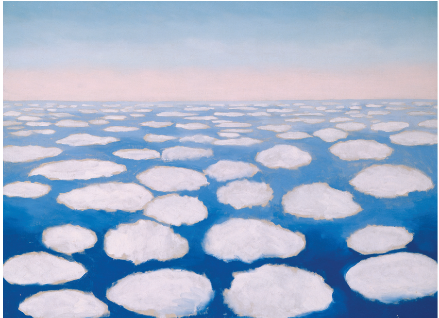
Georgia O'Keeffe. Above the Clouds I, 1962/1963. Oil on canvas, 36 1/8 x 48 1/4 in. Georgia O'Keeffe Museum. Gift of The Burnett Foundation and The Georgia O'Keeffe Foundation. 1997.5.14 [2006.05.460].